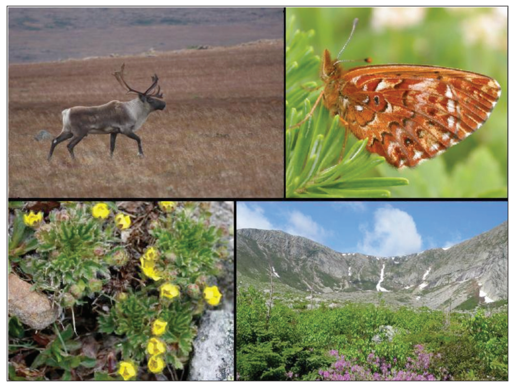
Figure 2. Although alpine habitat occurs as small, isolated patches on many mountains in northeastern North America, most of the total alpine area is confined to a few mountain ranges (Jones and Willey 2012a). These include the Chic-Choc Mountains of Québec, which support Woodland Caribou (upper left), Mount Katahdin in Maine (lower right), and the Presidential Range of New Hampshire, where endemic taxa such as Boloria chariclea montinus (Scudder) (White Mountains Fritillary) (upper right) and Potentilla robbinsiana (Robbins' Cinquefoil) (lower left) are found.

stabilized near current conditions, with alpine indicators increasing with cooler and wetter conditions during the past 3000 years. These post-glacial climatic oscillations likely increased the attrition of arctic-origin species isolated from their parent populations (Spear 1989). Much of the montane forest throughout the region was logged during the 19<sup>th</sup> and early 20<sup>th</sup> centuries, but disturbance in the alpine zone has been minimal (Carlson et al. 2011, Kimball and Weihrauch 2000). Domestic animals were grazed unsuccessfully on several alpine areas in the region, although not in the past 50 years, and the impacts of this practice are considered negligible (Waterman and Waterman 1989). Moose re-occupied the region in the past half-century, and they browse alpine plants occasionally, but they are thought to cause little damage. Rangifer tarandus caribou Gmelin (Woodland Caribou) historically occurred through northeastern North America and can influence alpine plant communities, but in this region they now occur only in the Gaspésie (Fig. 2; Jones and Willey 2012b,). Fire is not believed to be a major factor in the creation