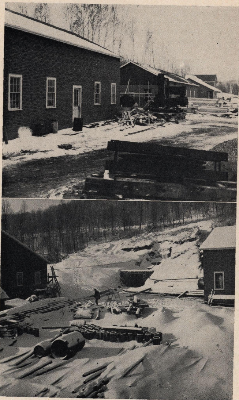
Plate I. Conditions at the Elizabeth Mine, January, 1943. Above , new buildings under construction. Below , the adit entrance to the workings in Copperas Hill.

to provide for possible future expansion. The voltage on this line is to be 33,000, but will be stepped down at the mine sub-station to 2,200 and 440 volts for the electric motors and to 110 volts for lighting at the mill plant and in the mine.