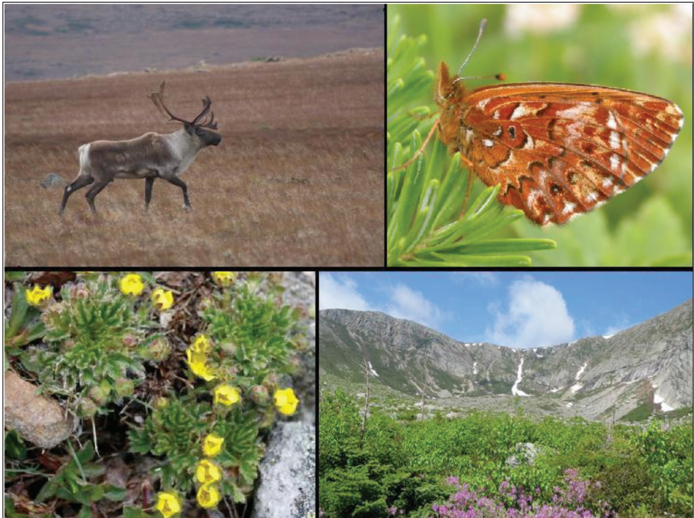
Figure 2. Although alpine habitat occurs as small, isolated patches on many mountains in northeastern North America, most of the total alpine area is confined to a few mountain ranges (Jones and Willey 2012a). These include the Chic-Choc Mountains of Québec, which support Woodland Caribou (upper left), Mount Katahdin in Maine (lower right), and the Presidential Range of New Hampshire, where endemic taxa such as Boloria chariclea montinus (Scudder) (White Mountains Fritillary) (upper right) and Potentilla robbinsiana (Robbins' Cinquefoil) (lower left) are found.

stabilized near current conditions, with alpine indicators increasing with cooler and wetter conditions during the past 3000 years. These post-glacial climatic oscillations likely increased the attrition of arctic-origin species isolated from their parent populations (Spear 1989). Much of the montane forest throughout the region was logged during the 19 th and early 20 th centuries, but disturbance in the alpine zone has been minimal (Carlson et al. 2011, Kimball and Weihrauch 2000). Domestic animals were grazed unsuccessfully on several alpine areas in the region, although not in the past 50 years, and the impacts of this practice are considered negligible (Waterman and Waterman 1989). Moose re-occupied the region in the past half-century, and they browse alpine plants occasionally, but they are thought to cause little damage. Rangifer tarandus caribou Gmelin (Woodland Caribou) historically occurred through northeastern North America and can influence alpine plant communities, but in this region they now occur only in the Gaspésie (Fig. 2; Jones and Willey 2012b.). Fire is not believed to be a major factor in the creation